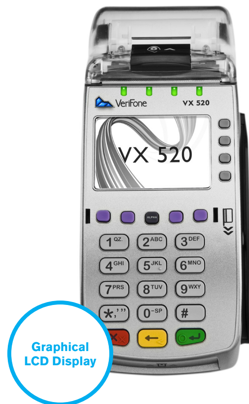
Graphical LCD Display