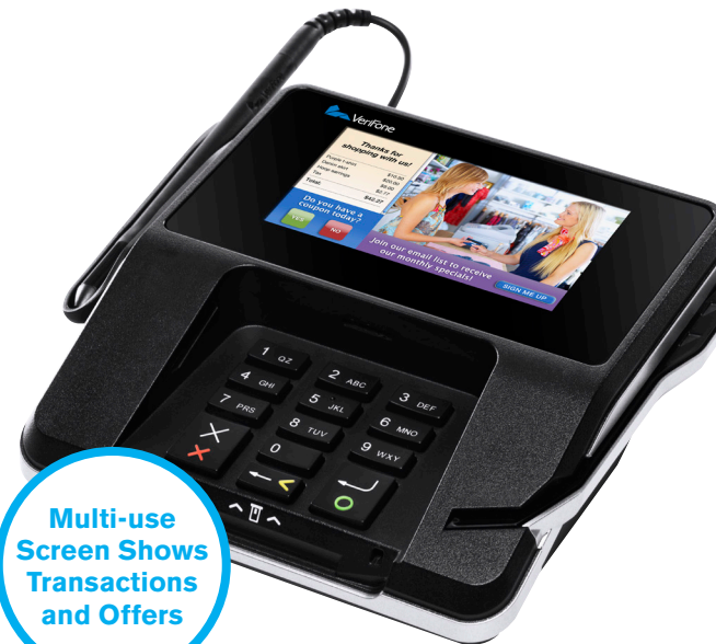
Multi-use Screen Shows Transactions and Offers